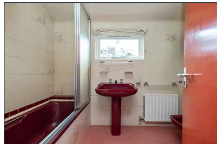
ENSUITE BATHROOM: Coloured suite comprising: low flush WC, bidet, pedestal wash hand basin, fully tiled walls.