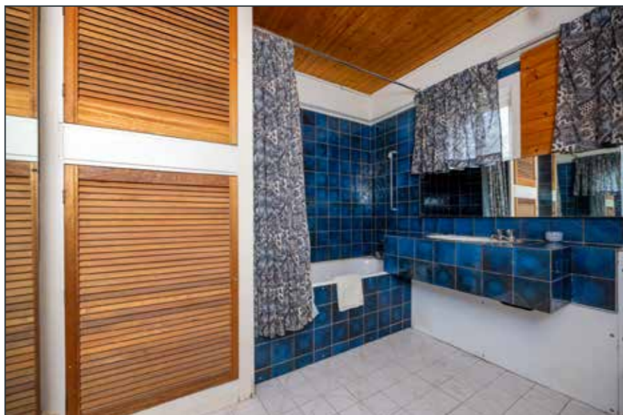
BATHROOM: White suite comprising: Panelled bath, vanity sink unit, low flush WC, partly tiled walls, ceramic tiled floor.