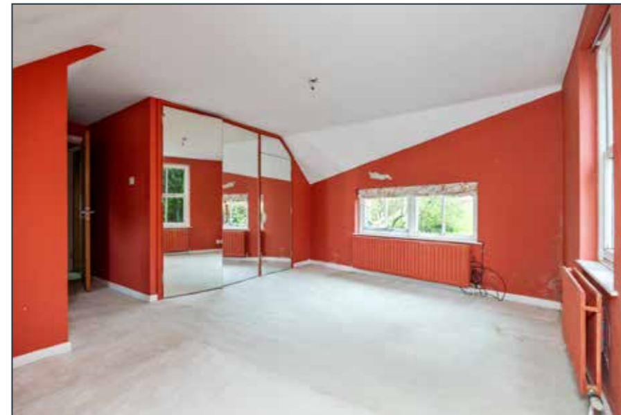
BEDROOM (1): 14' 7" x 12' 0" (4.44m x 3.66m) Built in robes.