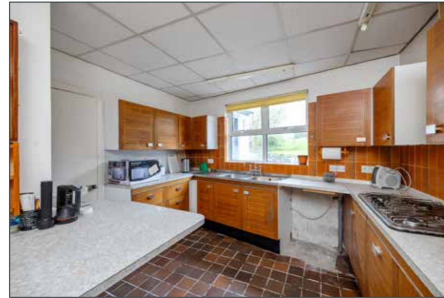
KITCHEN: 11' 3" x 10' 10" (3.43m x 3.3m) Max. Full range of high and low level units, stainless steel single drainer sink unit with mixer taps, 4 ring stainless steel gas hob, double oven, partly tiled walls, ceramic tiled floor.