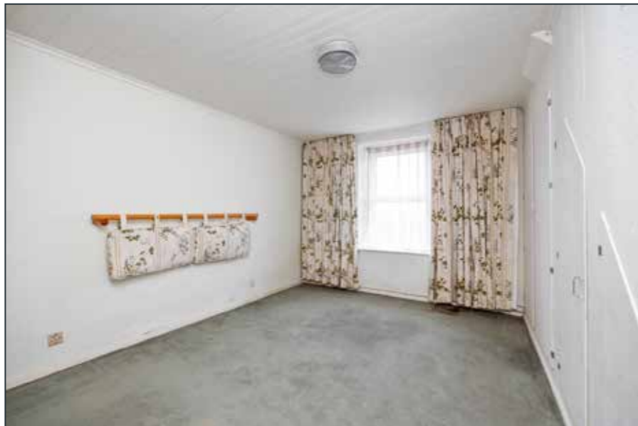
BEDROOM (4): 13' 3" x 10' 2" (4.04m x 3.1m) Built in robes, views to Ardmillan Bay.