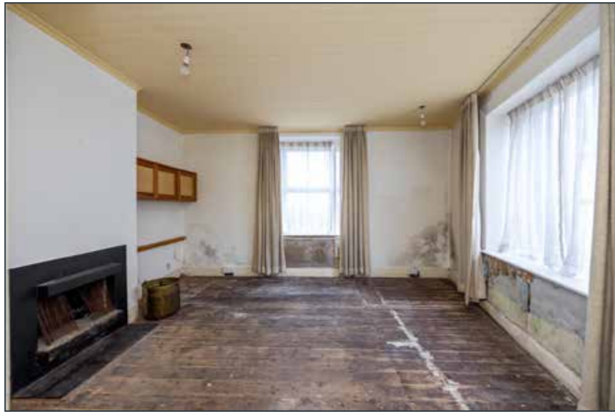
LIVING ROOM: 13' 10" x 13' 10" (4.22m x 4.22m) Views over Ardmillan Bay, open fire.