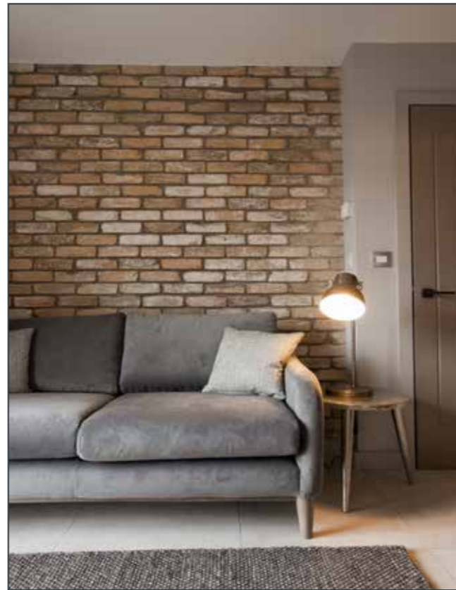
LIVING / KITCHEN / DINING AREAS