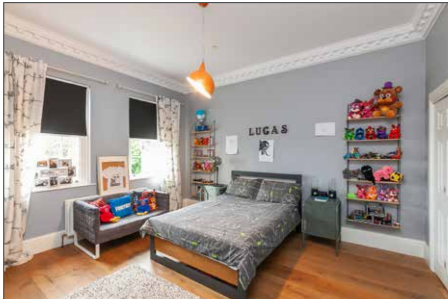
BEDROOM (3): 14' 8" x 13' 3" (4.47m x 4.04m) Wooden floor. Built-in robe. Cornice ceiling.