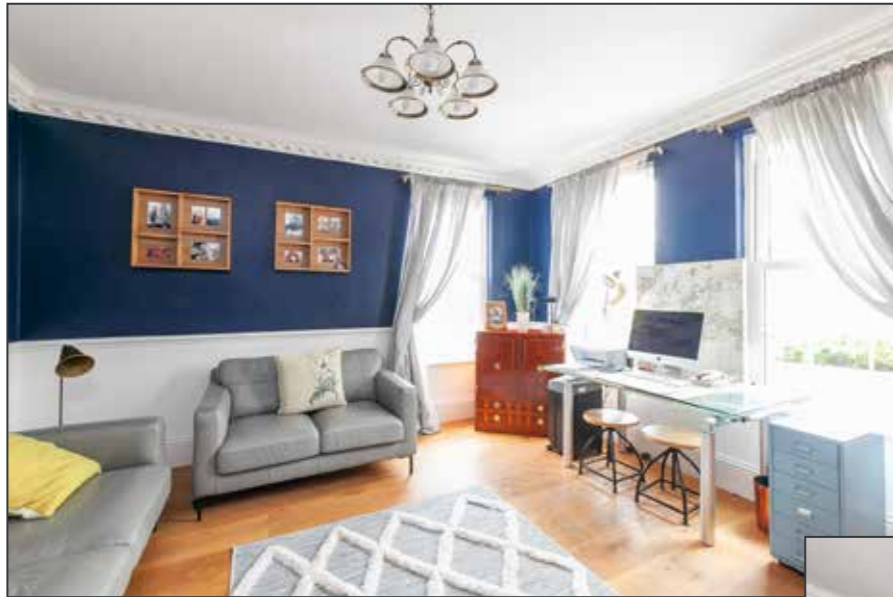
STUDY: 14' 0" x 13' 5" (4.27m x 4.09m) Wooden floor. Cornice ceiling.