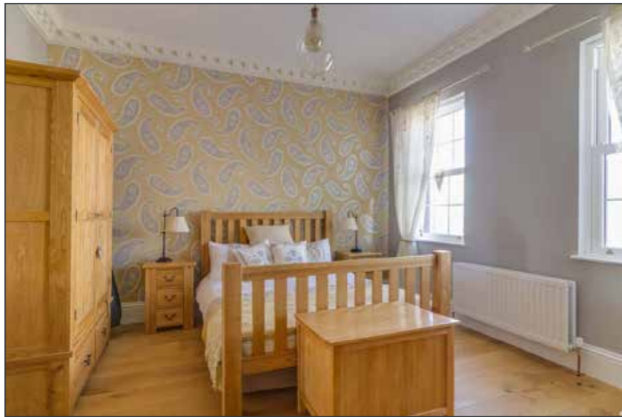
BEDROOM (2): 16' 10" x 13' 3" (5.13m x 4.04m) Wooden floor. Built-in robe. Cornice ceiling.