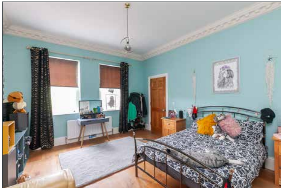
BEDROOM (4): 13' 7" x 13' 3" (4.14m x 4.04m) Wooden floor. Cornice ceiling.