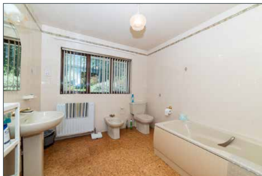
LARGE BATHROOM: 9' 10" x 8' 9" (3m x 2.67m) Panelled bath with mixer taps, thermostatically controlled shower unit, pedestal wash hand basin with mixer taps, low flush WC, bidet and fully tiled walls.