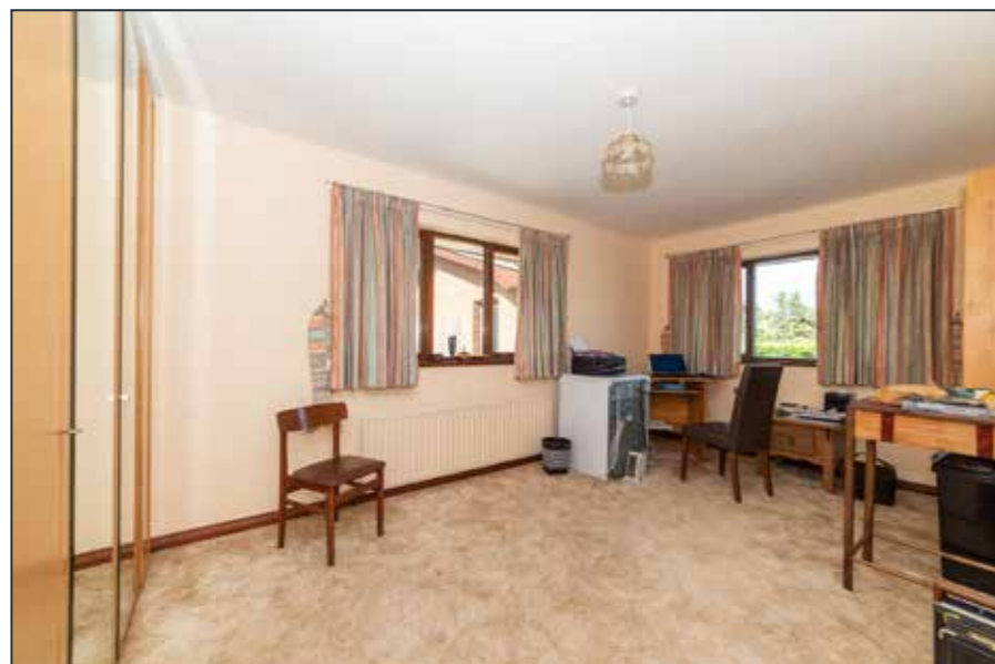
BEDROOM (2): 17' 0" x 10' 0" (5.18m x 3.05m)