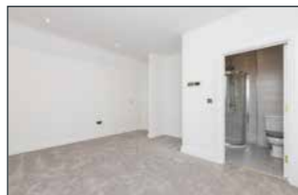
ENSUITE: 10' 1" x 5' 8" (3.07m x 1.73m)

White suite comprising of low flush WC, wash hand basin with vanity unit below and illuminated wall mirror above and corner shower with period style shower fittings. Chrome heated towel radiator. Fully tiled walls. Tiled floor. Recessed lighting.