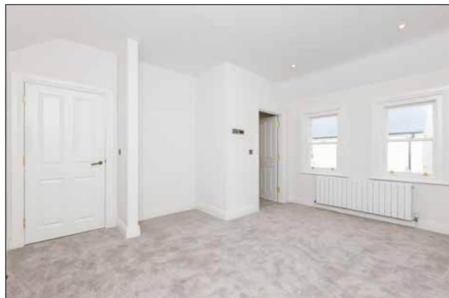
BEDROOM (1): 14' 9" x 12' 9" (4.5m x 3.89m) Max.