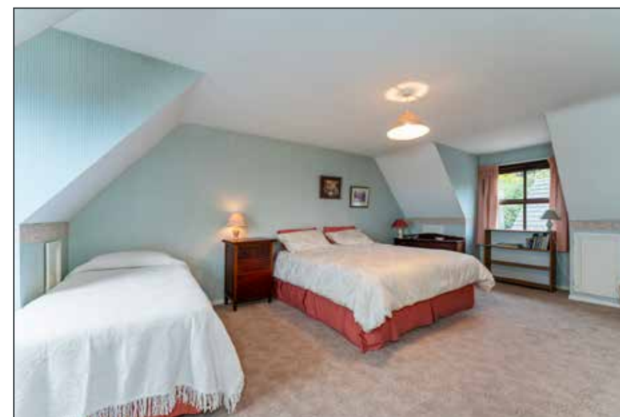
BEDROOM (2): 21' 5" x 12' 10" (6.53m x 3.91m)

Low flush WC, pedestal wash hand basin, panelled corner bath with mixer taps and shower attachment, tiled shower enclosure, half tiled walls, recessed lighting, ample eaves storage.