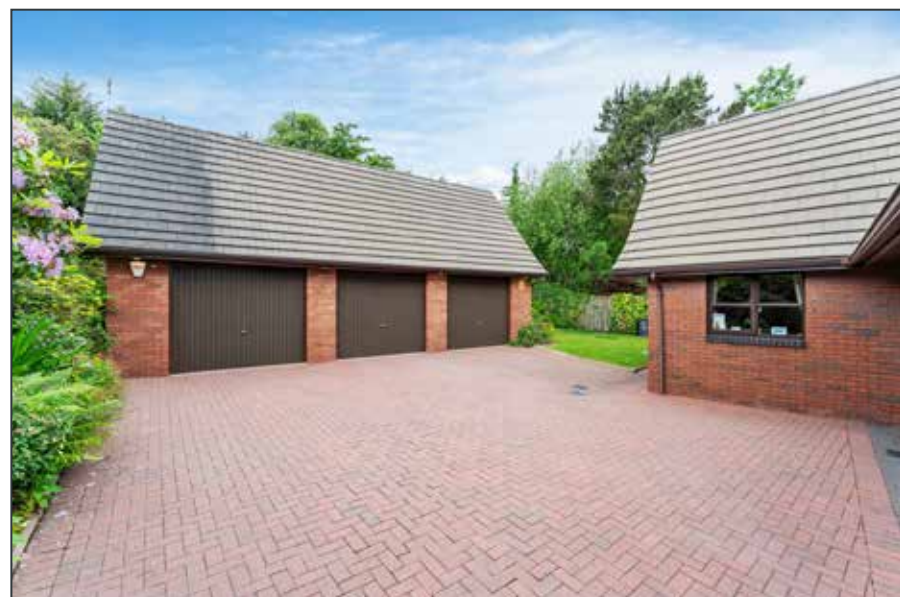
BOILER ROOM: 6' 2" x 5' 4" (1.88m x 1.63m)

Brick paver driveway to front, side and rear, garden laid in lawns with mature shrub beds and boundary. Water supply. Outdoor lighting.