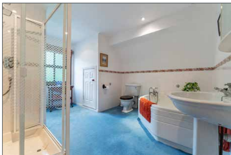
BATHROOM: 13' 2" x 10' 3" (4.01m x 3.12m)

Low flush WC, pedestal wash hand basin, tiled shower enclosure, velux window with blind.