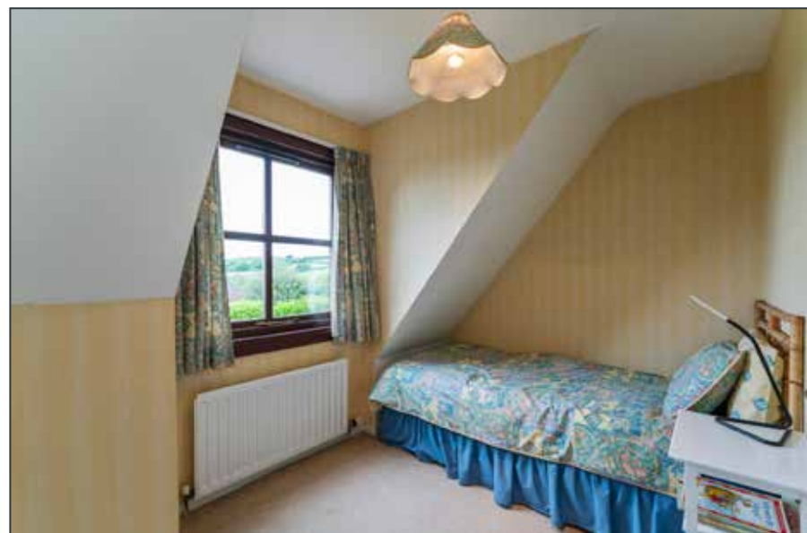
BEDROOM (3): 12' 10" x 7' 3" (3.91m x 2.21m) At widest points.