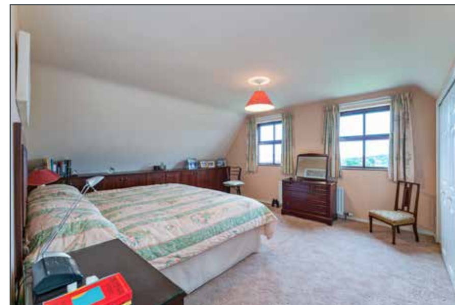
BEDROOM (1): 15' 5" x 13' 5" (4.7m x 4.09m)

Views across Belfast Lough, fitted storage cupboards, built in wardrobes, walk in wardrobe.