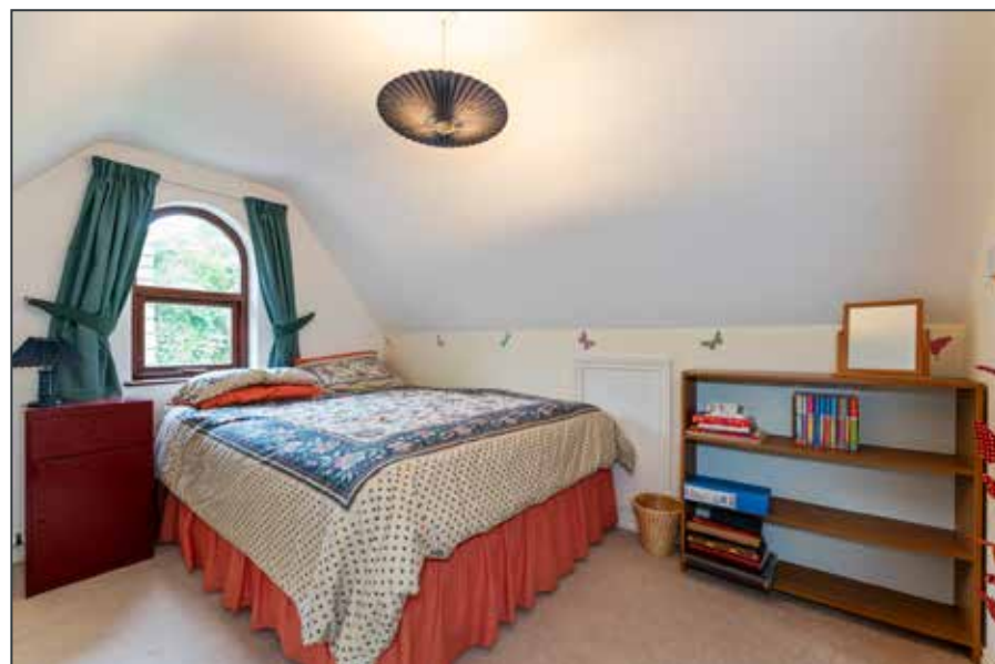
BEDROOM (4): 11' 5" x 8' 6" (3.48m x 2.59m)