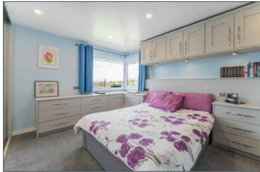
BEDROOM (1): 16' 6" x 10' 2" (5.03m x 3.1m) Built in sliding mirrored wardrobes and a range of fitted storage units, countryside views.