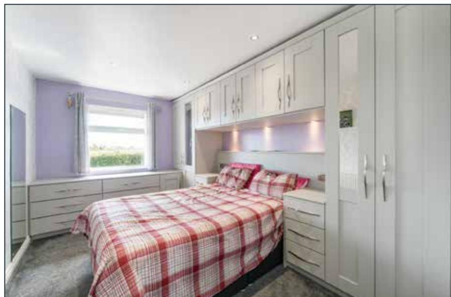
BEDROOM (3): 13' 11" x 9' 2" (4.24m x 2.79m) Built in storage and fitted wardrobes, countryside and sea views.

Private site laid in lawn with border fencing, patio area, range of shrubbery, outside tap and light, ample off street parking on driveway, informal security lighting.