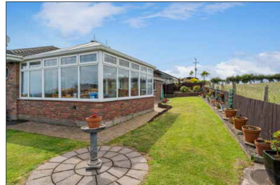
OUTSIDE GARAGE: 18' 7" x 9' 9" (5.66m x 2.97m) Up and over electric door, range of built in storage, plumbed for tumble dryer, freezer and space for American style fridge freezer, access to boiler.

Private site laid in lawn with border fencing, patio area, range of shrubbery, outside tap and light, ample off street parking on driveway, informal security lighting.