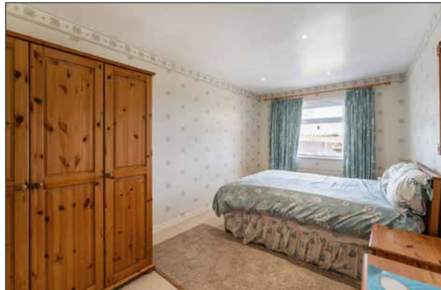
BEDROOM (2): 15' 2" x 8' 9" (4.62m x 2.67m) Countryside views.