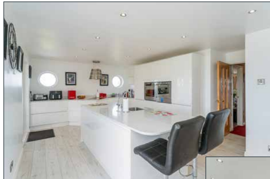
KITCHEN: 20' 7" x 15' 2" (6.27m x 4.62m)

Bespoke fitted kitchen with an excellent range of high and low level units with granite worktops, built in eye level oven and grill, built in eye level microwave, built in fridge and freezer, large centre island with a range of storage, stainless steel sink, 4 ring induction hob, recessed lighting, tiled floor.