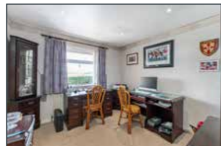
BEDROOM (4)/STUDY: 10' 5" x 8' 10" (3.18m x 2.69m) Countryside and sea views.