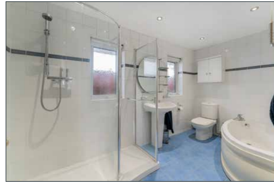
BATHROOM: Family bathroom suite comprising: Low flush WC, chrome heated towel rail, pedestal wash hand basin with mixer taps, panelled bath with mixer taps, corner shower unit with glass shower screen, fully tiled walls and floor, recessed lighting and extractor fan.